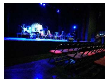
view of the stage, photo taken

The seating booked gave room for my wheelchair and a seat beside for Sue to sit in with a very good