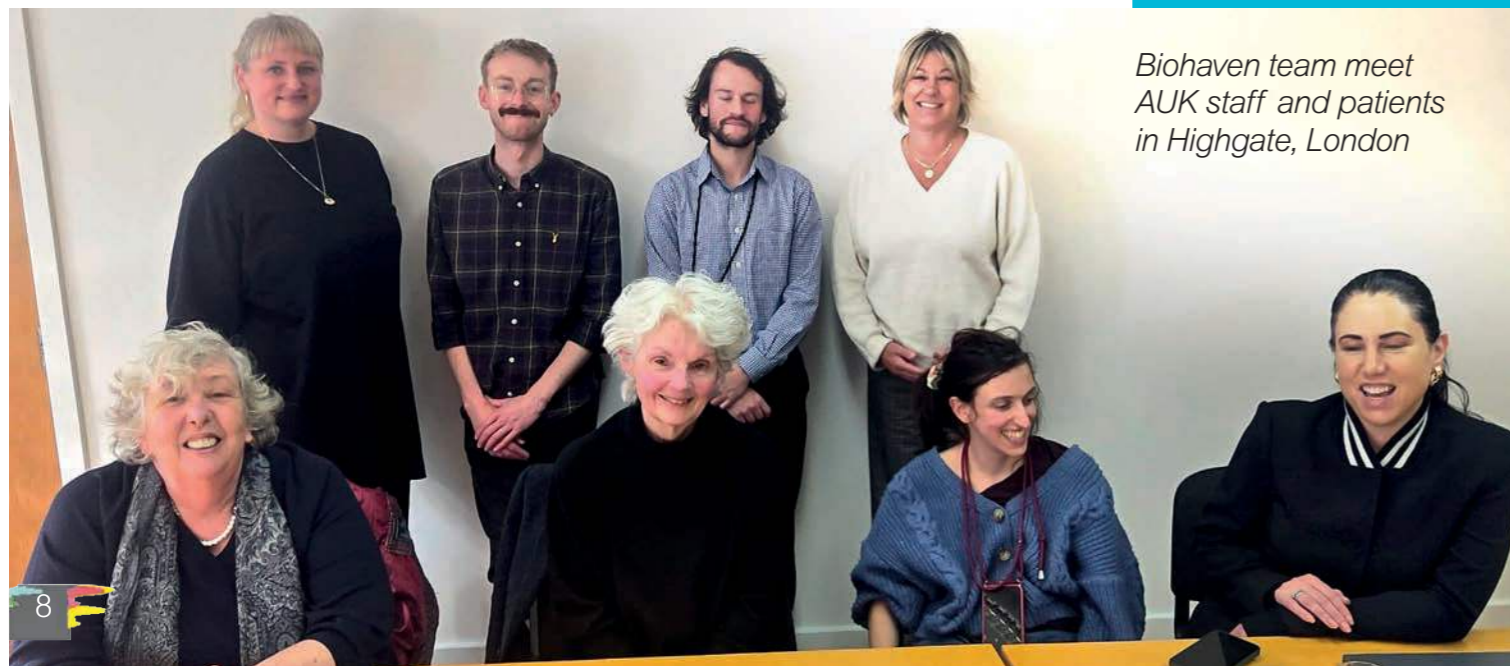
Biohaven team meet AUK staff and patients in Highgate, London