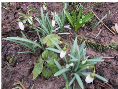
Spring is on its way?

Mine and Sue's finally happened on 15 th Feb after Sue saw an article in the Sunday paper telling you to do it online – we did and went the next day! On the Monday morning of going, we got letters telling us to book – too late we were off. Post jab, I was fine but Sue's a bit lethargic for a day.