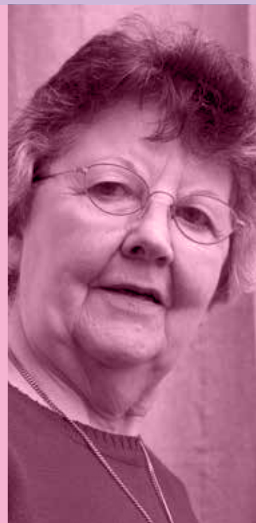
* Indicative image