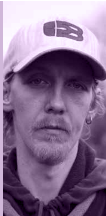
* Indicative image

Sometimes all it takes is a little bit of your time. You could end up talking to somebody, then realise they’re going through the same thing. Then all of a sudden, you realise you’re not alone.”