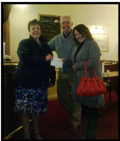
Again, we thank them

regular Barn Dance that they do for local charity. This year we shared the proceeds with the Butterfly Trust, a local hospice.