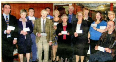
CHARITY CHEQUES: Eleven local groups have shared £2,000 from the latest Rotary Club of Boston St Botolph community care grant awards. Receiving an average £180 were Ataxia -East, Boston 141 Squadron ATC, Boston Athletics Club, Boston Cruise Bereavement, Boston Orchestra, Boston Town Juniors FC, Caring Companions (Alzheimer's), Centrepont Outreach, Five Villages Day Care, Headway Lincolnshire and Pilgrim Hospital Radio.

To my surprise and relief I found several other local charities there and all we had to do was go up and receive the cheque.